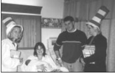
Lima EA uses NWOEA Public Relations Grant. See article on page 6.

101 W. Sandusky - Suite 302 PO Box 1042 Findlay, Ohio 45839