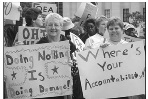
NW OEA members from Maumee EA enthusiastically show their support at the OEA Rally following the May 24th Lobby day. Check out other OEA Rally photos on the NWOEA web site at www.nwoea.com .